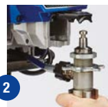
2 Open door and remove pump