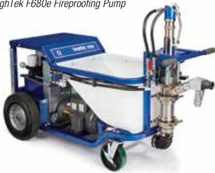
ToughTek F680e Fireproofing Pump